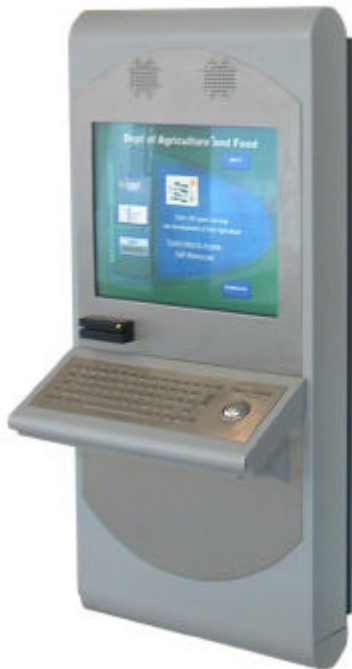
PDL100 Wallmount shown with keyboard, trackball & swipe card options.